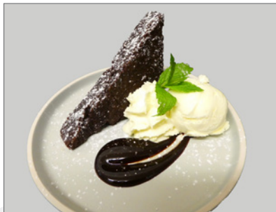
RICH DECADENT CHOCOLATE FUDGE BROWNIE (gfo)