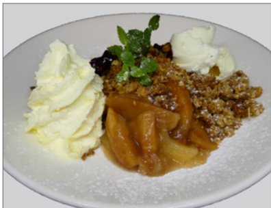
APPLE & RHUBARB CRUMBLE