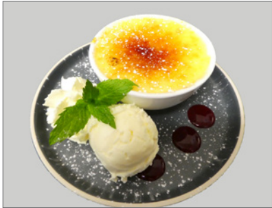
CRÈME BRÛLÉE (gfo)